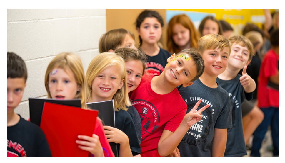
Pictured: McVay Elementary students line up in the hallway giving peace signs and thumbs up before singing on stage at the 2nd Annual Grow & Glow Festival in September of 2023.