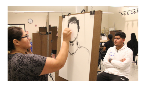
Photo: WCHS student sits for portrait by Otterbein University student.