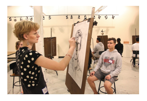
Photo: WCHS student sits for portrait by Otterbein University student.